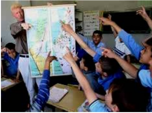
Figure 12. Palestinian children in Hebron learning about the Nakba.