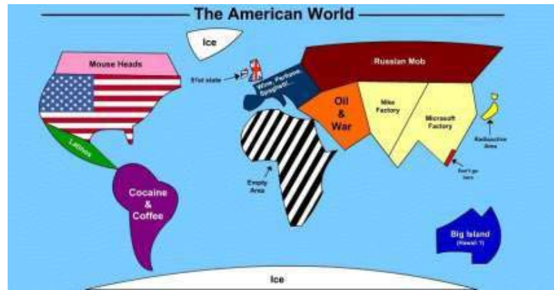
Figure 4. Mapping stereotypes: How America sees the world 6.

Collective cognitive maps impact directly on the Israeli-Palestinian conflict. The source of the conflict is the battle over the same territory between these two groups. Their words and deeds make it clear that each group understands or "sees" the past, the present and the future of this territory from its own perspective. Each perspective differs radically from the perspective of the other, thus forming the basis for two different spatial perceptions of nationality.