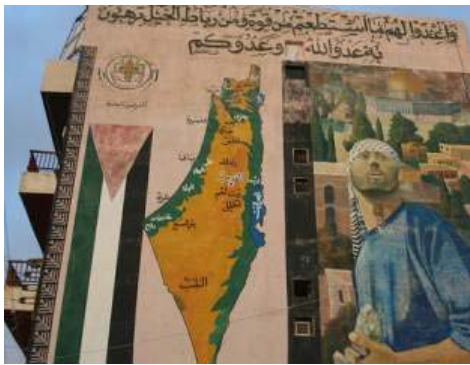
Figure 10. Drawing on the wall of a house in Gaza, illustrating the Palestinian narrative.

Figure 11 is taken from the main Internet site of the Hamas. The home page displays a poster marking Nakba Day with a picture of an armed terrorist on top of the map of Palestine. The text on the right underlines the need to continue using terror until the refugees return and all of Palestine is "liberated." 14