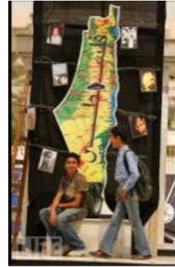
Figure 13. Pupils in the Gaza Strip standing next to a map marking 60 years since the Nakba.

The gradual diminishment of Palestinian territory is stressed in all the maps and atlases. The maps underscore the Palestinian narrative, according to which they have been the victims of aggression in a territory that belongs to them and are therefore permitted to fight for the right to rectify this injustice (Figure 14).