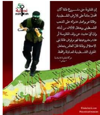
Figure 11. Poster of the Hamas movement marking Nakba Day.

According to the Palestinian media, special lessons were held in the schools in the "territories" prior to Nakba Day to instill messages denying the State of Israel's right to exist. Figure 12 shows a Palestinian teacher in a school in Hebron teaching a lesson about the Nakba, showing the pupils two maps with the title "Palestine" written in Arabic and with no trace or mention of the State of Israel. 15 Figure 13 shows pupils in the Gaza Strip next to a map that marks 60 years since the Palestinian Nakba and negates the existence of Israel. 16