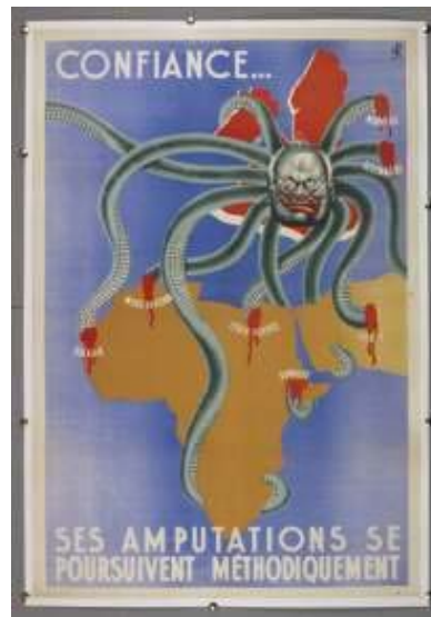
Figure 2. Nazi propaganda poster. 2

Mapmakers with vested interests deliberately manipulate cartographic means to produce maps intended to convey ideas they wish to express and thus to create their own version of the "truth." Maps such as these focus only on those facts or ostensible facts likely to elicit the behavior and thoughts desired by those who commissioned the map. To this end a variety of cartographic techniques are used: omission or addition of details; use of various projections; alterations of scale; choice of statistical data; stressing a particular topic; choice of place names; attention paid to page and text design; selection of a title for the map; and choice of dramatic and provocative symbols and colors. 3