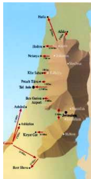
Figure 6. Cartographic manipulation using colors, arrows and projections to emphasize the strategic importance of Judea and Samaria.

Though motivated by opposing ideologies, movements both on the political left and right make use of cartographic techniques to draw attention to Jewish settlement in Judea and Samaria. The left wants to show the size of the territory appropriated from the Palestinians, while the right seeks to emphasize the achievements of Jewish settlement. 8