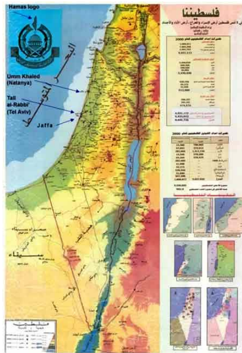
Figure 9. Map of Palestine distributed in the Gaza Strip by the Hamas movement.

The reality depicted by most of the maps issued by the Palestinian Authority 12 and by all the maps issued by the Hamas movement is of the nation of Palestine stretching from the Jordan River to the Mediterranean Sea, with no indication of the Green Line and no mention of the name of Israel. The major message understood from these maps is that only the Palestinians have a right to the Palestinian homeland. The Hamas, which has been in control in the Gaza Strip since 2007, completely denies the existence of the State of Israel and makes extensive use of militant Islamic slogans. Hamas maps depict Palestine as covering the entire sovereign territory of the State of Israel. Furthermore, the names of Israeli localities established by the Zionist movement have been systematically obliterated from the maps, leaving only the names of Arab localities or cities that were under Arab control prior to 1948 (Figure 9). On this map, published by the Hamas movement in Gaza, the tables and small maps on the right side provide data about the dispersion of the Palestinian refugees and the refugee camps in order to underscore the right of Palestinian refugees to return to the entire historical territory of Palestine. The title in the upper right hand corner states: "Our Palestine – Let us not forget Palestine, the land of our fathers and forefathers." Only Arabic names of localities are noted on this map (IICC, 2004).