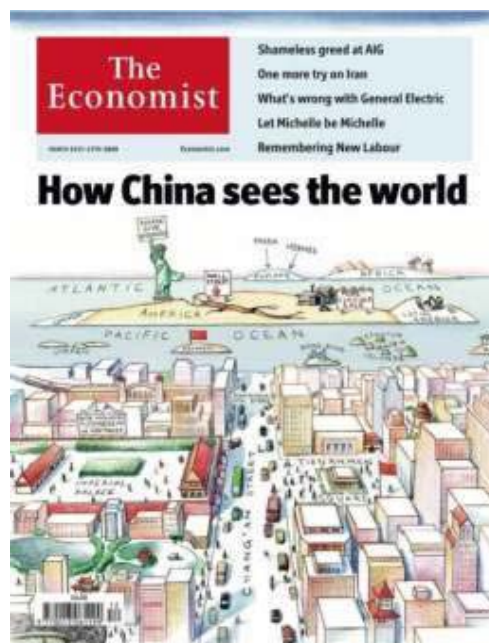
Figure 3. Mapping stereotypes: How China sees the world. 5

While cognitive maps are personal and generated in the mind of each individual, there are groups of people whose cognitive maps are similar – collective maps, of sorts: national groups, ethnic groups, social groups and the like. These collective maps resemble a common language in that members of two different groups are likely to build different maps describing the same phenomenon or the same territory. Collective maps are usually maps of the stereotypes that are an integral part of the culture in which we live. These stereotypes are indeed influenced by distinctions between groups, but their primary influence derives from the ways the groups relate to one another. When the interests of two groups are at odds, this will be expressed by negative stereotypes. 4 In the following maps the graphic designers have created maps in accordance with the viewpoints of their intended audiences (Figure 3, Figure 4).