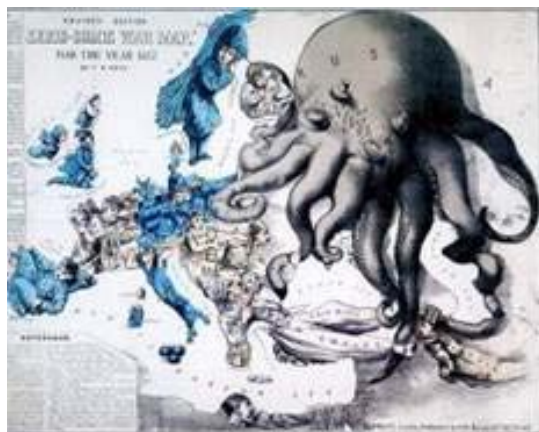
Figure 1. Satirical map published in London in 1877. 1

The ability to use maps to represent a chosen realism that goes beyond physical reality turns maps into an extremely significant political tool (Collins, 2004). Throughout the history of mapmaking, heads of state have exploited this tool for propaganda purposes or to convey political themes (see Figure 1 and Figure 2). Not only did maps describe facts, but they also depicted worldviews, and in addition to their practical uses have also served as tools for education and for shaping consciousness.