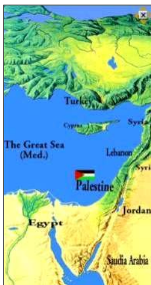
Figure 7. Map of the Middle East with Palestine depicted instead of the State of Israel.

Over the years, the Palestinian educational system has tended to disregard the existence of the State of Israel. On maps, in atlases and in textbooks Israel does not exist, except through allusions in negative contexts. In contrast, Palestine is depicted as a nation-state despite not yet having that status (Figure 7, Figure 8). 11