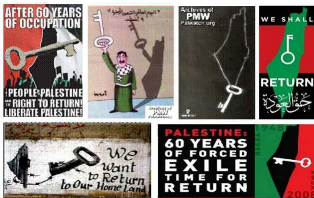
Figure 16. An assortment of maps depicting the map of Palestine, with a key symbolizing the right of return. 23