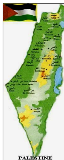
Figure 8. Map of Palestine with Palestinian Authority flag emphasized.