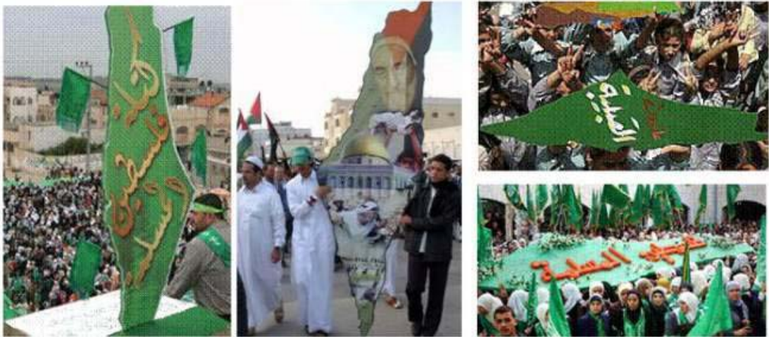
Figure 15. Maps of Palestine at different demonstrations in the Gaza Strip.

The map of Palestine also serves as a major element in various demonstrations held by Palestinians against the State of Israel. 21 Figure 15 shows photographs from various demonstrations in the Gaza Strip, where the events are dictated by Hamas. In these demonstrations, the maps of Palestine are usually green, the color of Islam. This color ties the land of Palestine to the sanctity of Islam and therefore puts across the message that no negotiations about future borders can be held with Israel.